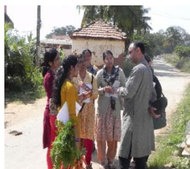
Interns posting in rural health care centres for 2 months

The Division for Humanities and Health under SJRI promotes the idea of the humanities in health among practitioners of health care, and provides avenues to educate our students on the links between the humanities and the practice of medicine. By stimulating dialogue between society and health practitioners by means of debate, drama, art, music and creative writing, it aims to realize the ideal of “person-centered” care. This approach, along with the Major General SL Bhatia Museum of the History of Medicine Museum maintained by the division provides unique global, historical and evolutionary perspectives to our students enabling them to evolve into more humane practitioners of medicine. " Three student - led initiatives are located in the Division of Health and Humanities: "Spotlight ", the theatre group; "Ecologics", the environmental group and "The Quillosophical Society", the literary group".