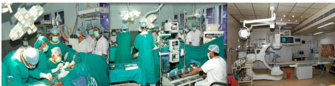
Well-equipped and well-staffed operation theatre complex and imaging facilities

In addition St. John's Laboratory Services inclusive of Clinical Microbiology, Clinical Biochemistry Pathology, Clinical Pathology and Genetics have excellent well-standardised, NABL accredited (since 2006) Service Laboratories . Most of the diagnostic tests are conducted on automated, advanced instruments and are monitored by a strict quality control and quality assurance programme. There is also a molecular diagnostic and research facility. A state of the art blood bank managed by the Department of Transfusion Medicine and Immunohematology provides services to patients including a large number of Haemophiliac patients, who have registered with the Hospital for regular blood transfusion.