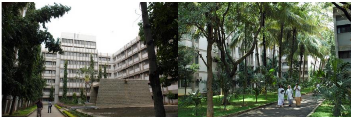
St. John's Medical College Hospital

In addition St. John's Laboratory Services inclusive of Clinical Microbiology, Clinical Biochemistry Pathology, Clinical Pathology and Genetics have excellent well-standardised, NABL accredited (since 2006) Service Laboratories . Most of the diagnostic tests are conducted on automated, advanced instruments and are monitored by a strict quality control and quality assurance programme. There is also a molecular diagnostic and research facility. A state of the art blood bank managed by the Department of Transfusion Medicine and Immunohematology provides services to patients including a large number of Haemophiliac patients, who have registered with the Hospital for regular blood transfusion.