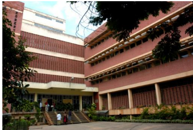
The College building - Robert Koch Bhavan in 1980