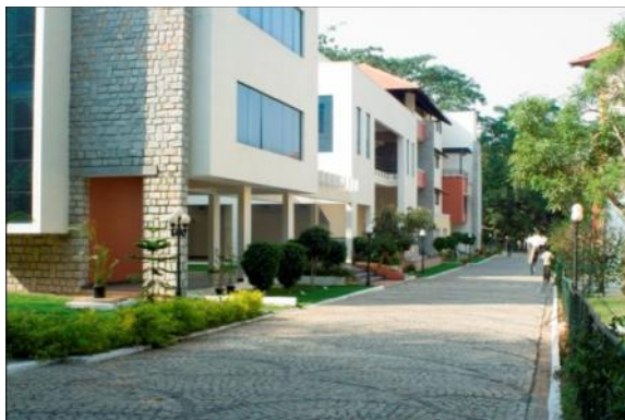
St. John's Research Institute

The Institution places a strong emphasis on ethical research. In keeping with these objectives as well as regulatory requirements all Institutional research is approved and monitored by the Institutional Ethical Committee.