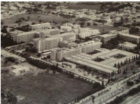
Aerial view of St. John's Medical College in the early eighties.