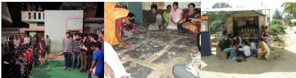
Rural Orientation Programme for the 1 st MBBS Students at the Institution's Community Health Training Centre at Mugulur

St. John's Medical College from its inception has been unique in emphasizing the importance of sensitizing medical students to medical ethics, even when it was not a 'syllabus requirement'. The Department of Medical Ethics with expert faculty from various departments and backgrounds ensures that medical students get a broad based, yet in depth understanding of how to handle