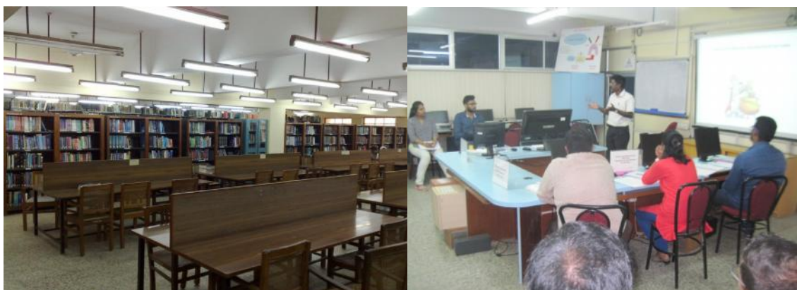
Zablocki Learning Centre (Central Library)