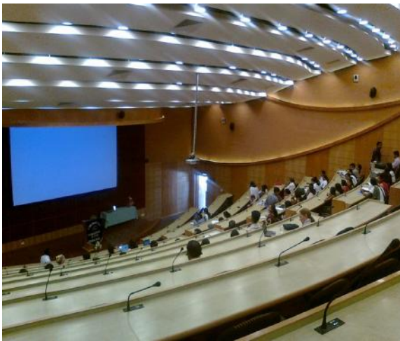
Pope Paul IV Auditorium, SJRI