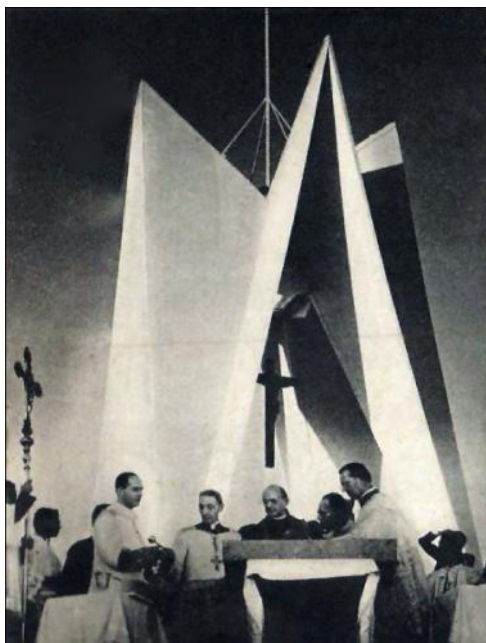
Blessing of the corner stone of the Medical College Project at the Eucharistic Congress in Mumbai, 3 December 1964

In the course of their Joint Pastoral letter issued in connection with the XXXVIII International Eucharistic Congress, held in Bombay in 1964, the Catholic Bishops of India, announced their choice of the College project as the Chief Memorial of the Congress. This choice received the warm approval of His Holiness, Pope Paul VI, which was conveyed by him in a special message addressed to His Eminence, Valerian Cardinal Gracias, the then President of the CBCI Society for Medical Education. His Holiness, also established a scholarship in the College in his own name, to be awarded, each year, to the best all-round student completing the MBBS course.