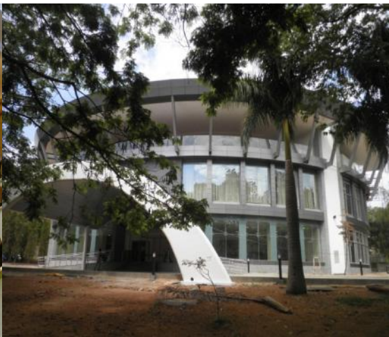
St. John's Main Auditorium