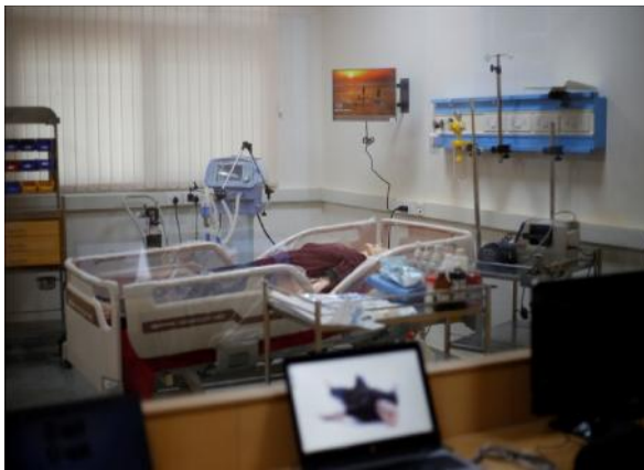
SIM - Man3 simulator for hands on training

focuses on training medical students and health professionals about what to expect, and how to respond in a clinical scenario, thus providing excellent hands on training to students and preparing them for real patient encounters. Teleconferencing/tele medicine facilities available in the skills lab and the hospital, provide our faculty and students opportunities for teaching and learning with international experts.