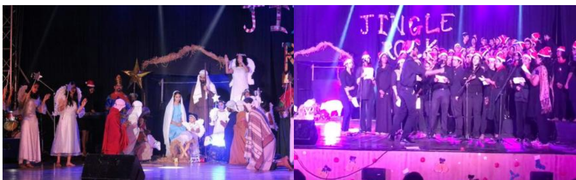
Jingle Rock, the campus Christmas Fest