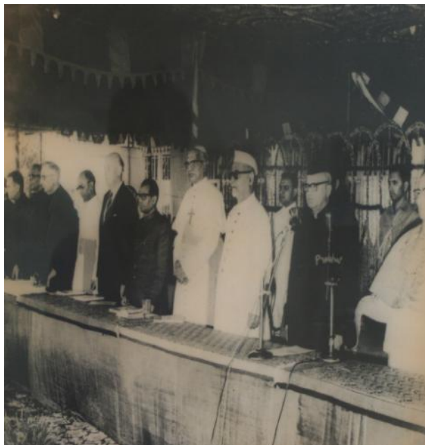
Dedication of the College by his Excellency Dr. Zakir Hussain, former President of India, 1968