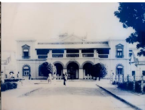
St. Martha's Hospital to which St. John's Medical College was affiliated for clinical services and training until 1983.